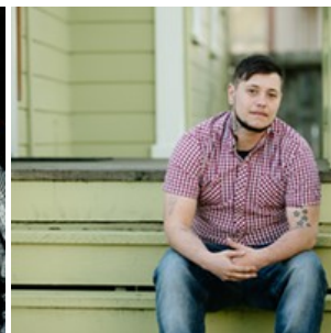
ACLU Lawsuit Accuses St. Joseph Hospital of