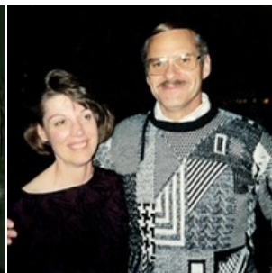
County Settles Magney Case for $1 Million Mar 28, 2019