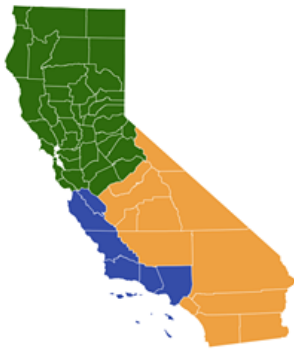
California Three States Initiative (2018)

Proposed states California Northern California Southern California BALLOTPEDIA